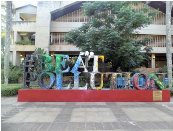
Theme of the meeting