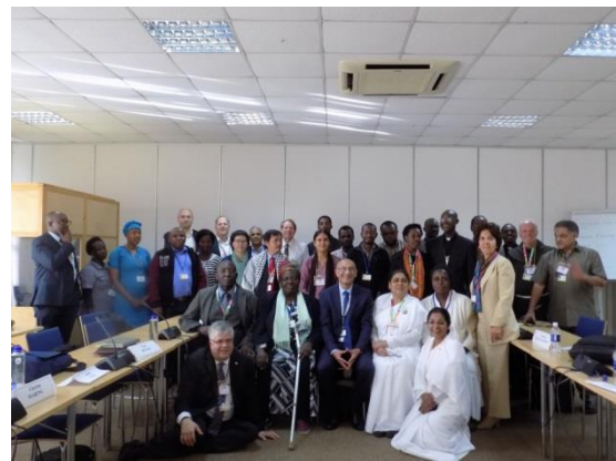
Group photo for the Faith Based Organizations